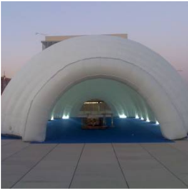
2011 Membranes Conference.